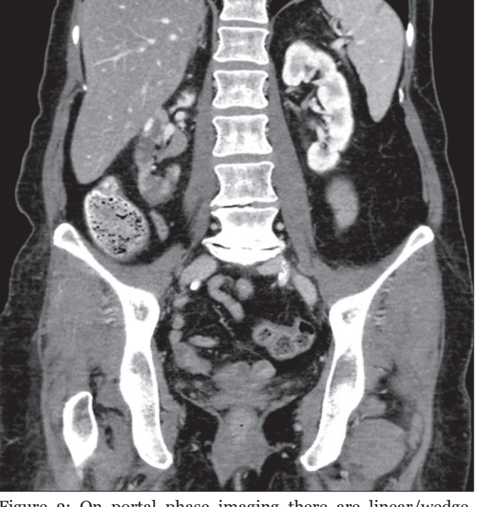
Figure 3: On portal phase imaging there are linear/wedgeshaped areas of low attenuation of the spleen involving the anterior aspect and subdiaphragmatic aspect, suspicious for recent splenic infarct. Computed tomography scan of abdomen pelvis with contrast.