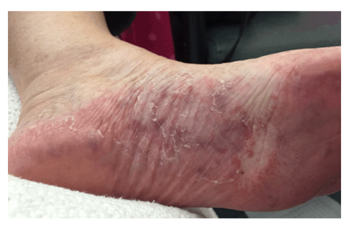
Figure 4: Dermatological manifestations of atheroembolism: livedo reticularis on the inferomedial aspect of the left foot.

manifestation of cholesterol embolization syndrome after cardiac catheterization [11]. This varies greatly however with Drost et al. finding a 0.002% incidence of cholesterol embolization in their review of 4587 cardiac catheterizations [1].