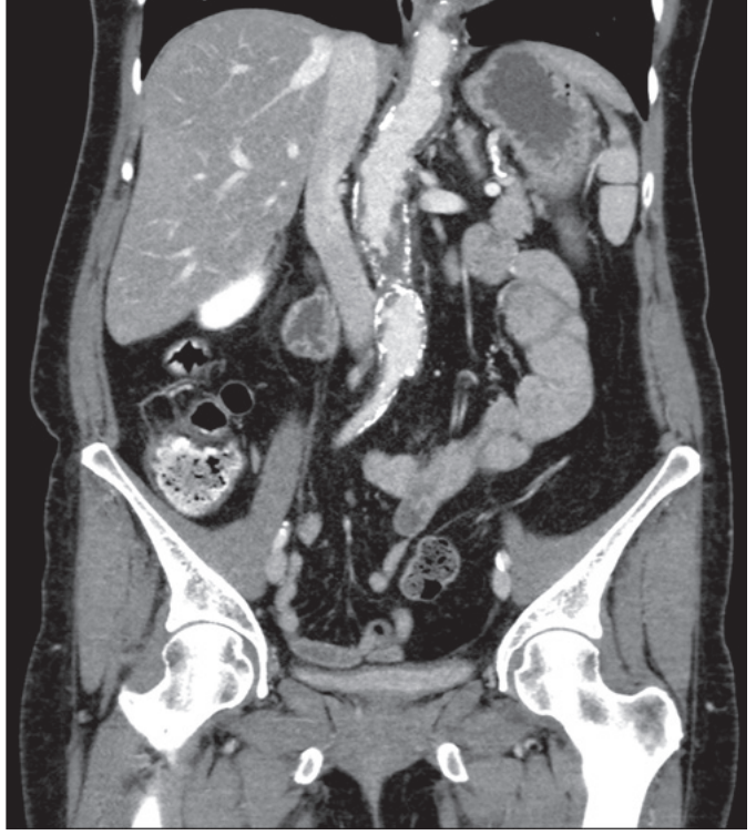
Figure 1: Extensive irregular mural plaque/thrombus throughout from the descending thoracic aorta to the infrarenal aorta. Computed tomography scan of abdomen pelvis with contrast.

Following the angiogram the patient reported a return of abdominal pain, this time right sided and radiating through to the back. An abdominal CT scan was requested which demonstrated severe atherosclerosis in the abdominal aorta (Figure 1) embolic phenomenon and acute infarcts were seen in the kidneys (Figure 2) and spleen (Figure 3). It was thought that this was likely secondary to an aortic cholesterol thrombotic plaque shower that may have been precipitated by the angiogram. A lactate of 15 was returned at this time, creatinine rose to 112 umol/L (baseline of 77 umol/L) and eGFR reduced to 46 mL/min/1.73 m<sup>2</sup> (baseline 65 mL/min/1.73 m<sup>2</sup>). Five